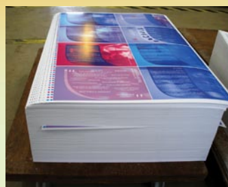
Ready for the next stage