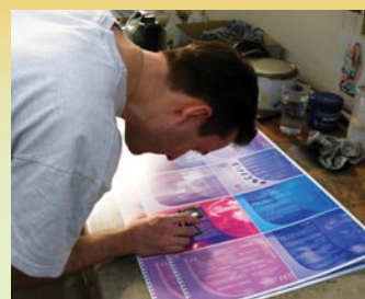
Checking the detail

Those of you who are familiar with our website will note that the design was mirrored from that. However, a lot of thought was put into the final product and after many meetings and ideas later we went along to "the making of" our brochure at the printers.