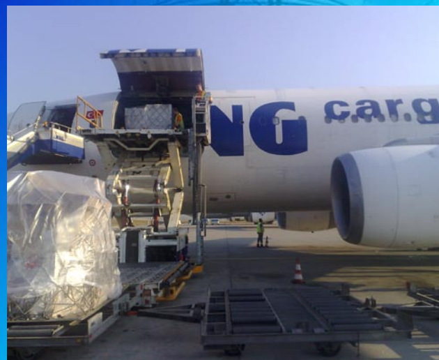
Unloading at Istanbul Airport

We had to organise collection of some large over-sized freight from Tenerife in the Canary Islands to be dispatched immediately to the power plant in Istanbul. As there were no direct flights to Istanbul we had to route the goods via Madrid. Because of the timeframes involved a specialist charter aircraft had to be arranged from Madrid to Istanbul. John flew to Madrid to arrange the documentation and supervise the loading of the goods. Later that night the locals of Istanbul carried on life as normal with minimal interruption to their power supply. A very close shave!!