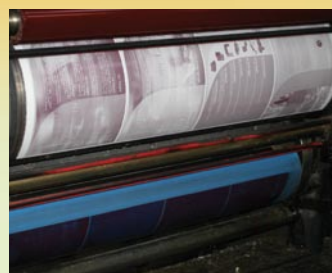
On the production line